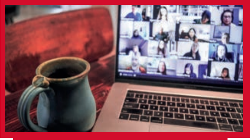
Online services/ meetings - a way to be together whilst apart

We have since found a method of connecting a computer to run PowerPoint, into the system, alongside the Zoom computer. We have now embarked upon a project which should end up with us being able to Zoom hybrid meetings from virtually anywhere in the church building, so that those who physically find it difficult to get to church