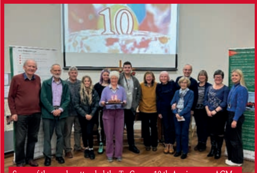
Some of those who attended the Ty Croeso 10 th Anniversary AGM.

While some of our past activities have not returned, others continue in different ways, and our links into the community are stronger than ever.