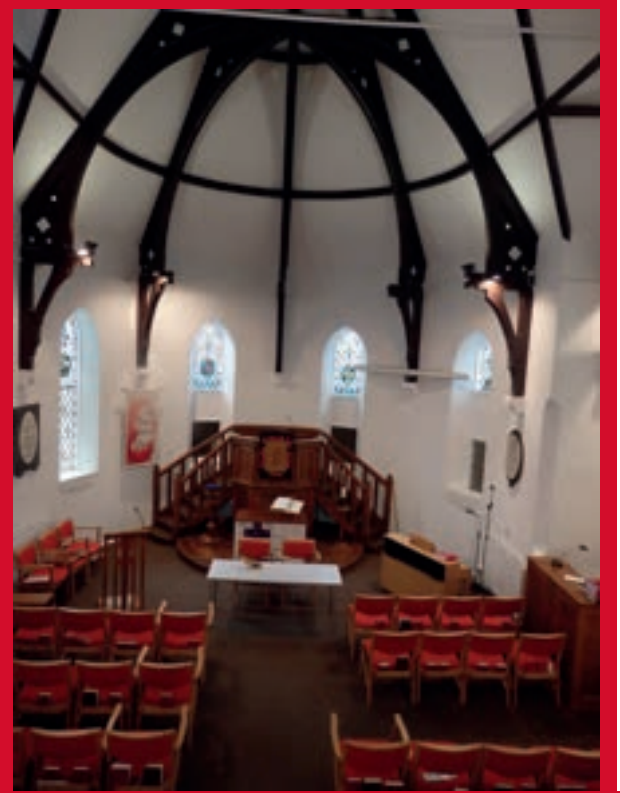
Uniting Church Sketty Zooming to a home near you