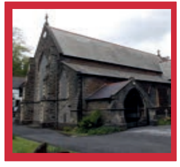
Brunswick Meet at St James' Church Walter Road, Swansea, SA1 4QA 1st & 3rd Sunday (Zoom) 10am 2nd & 4th Sunday (St. James) 3pm 5th Sunday (St. James) 10.30am