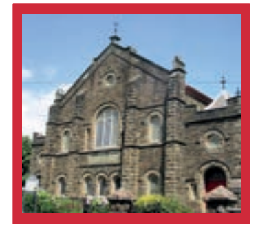
Clydach Heol-Y-Nant, Clydach, Swansea, SA6 5HB Sundays 3pm In the Church Hall