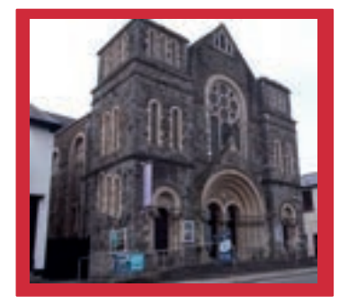
Mumbles Mumbles Road, Mumbles SA3 4EA Sunday 10.30am Wednesday (Zoom) 12.00pm