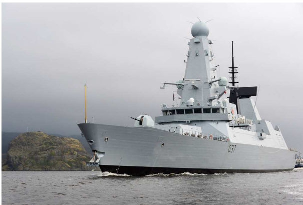
HMS DUNCAN (D37)

While the Chaplains work tirelessly, they cannot be on every Ship all of the time. Where a Ship does not have a Chaplain embarked a member of the Ships Company will take the lead on worship and fellowship. He or she is supported in this by correspondence from Chaplains ashore and from the Ship's Church Resource Pack, a collection of various hymn books, bibles, devotionals and a hymnal music player, affectionately known as the "Bish in a Box". And so it is that 24 hours after leaving Morning Worship in Mumbles I am sat, the Good Book in hand, planning HMS DUNCAN's next Sunday service as the Ship ploughs south through the Atlantic.