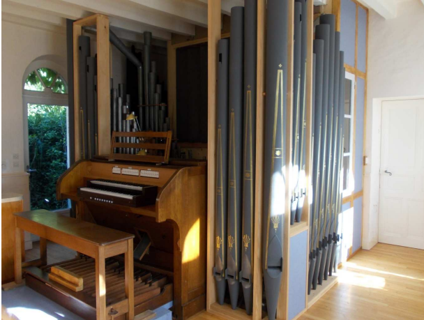
The restored Speechley Organ

When the redevelopment project at Mumbles Church was being undertaken one of the conditions of the grant from the Heritage Lottery Fund was that the Speechley pipe organ be either restored and reinstated in the new building or that a good home be found for it.