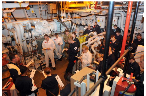
Sunday Worship at Sea (stock photo)

Our services range in style from traditional to contemporary and the congregation mimic's those found ashore, we have our regulars, visitors and the curious. Services have to fit within the Ships operational programme which means worship can take place at odd hours and just like churches on land we compete against all the same distractions of work, sport etc. On a routine sailing some services may only have a dozen or so people; conversely, prior to an Operation it is 'standing room only' as we all come together to pray for courage, that the Lord will keep us safe and that His Grace will comfort our families.